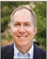
KNOX WHITE Mayor City of Greenville Greenville, S.C.